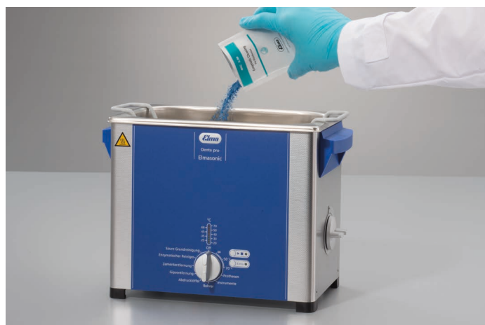
Dosing EC 15 in Elmasonic Denta pro H

The virucidal properties ensure a high degree of individual protection. Sequential use of EC 15 and EC 55 will bring about a comprehensively bactericidal and virucidal effectiveness (high-level disinfection chain).