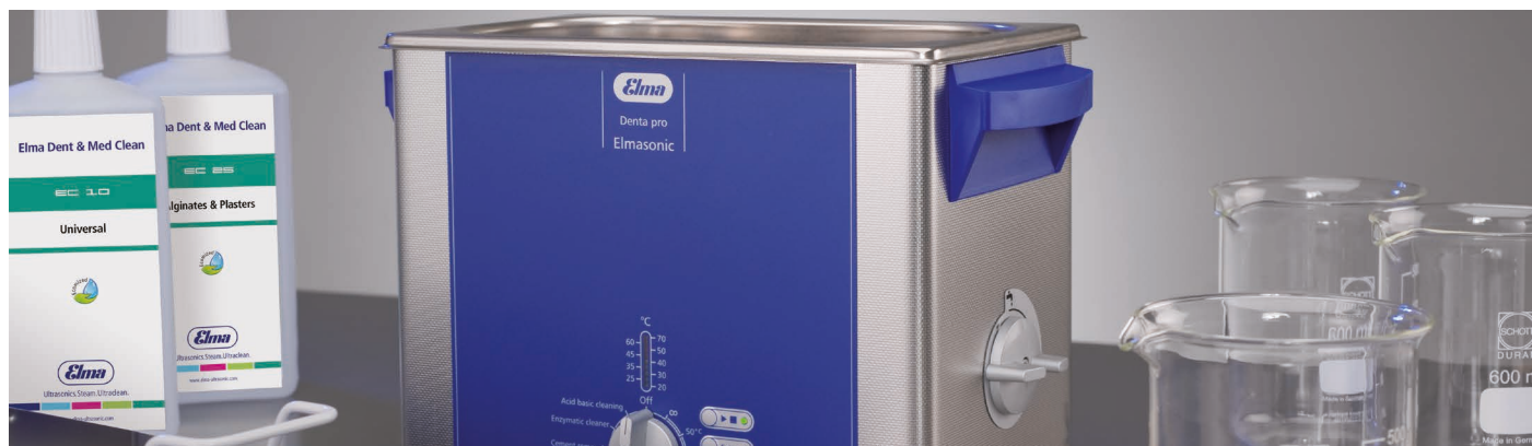
Elmasonic Denta Pro H with Elma Dent & Med Clean cleaning chemistry and suitable accessories

Programme-controlled and optimized for the needs of dentist and dental lab alike