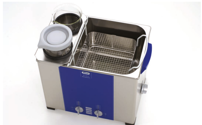
Simultaneous cleaning (and if necessary disinfecting) instruments and drills as well as prostheses in the basket and two glass beakers and perforated lid