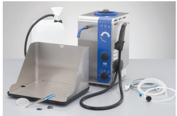
Elmasteam 8 basic steam jet cleaning unit with evaporating dish and further accessories

Use of the Elmasteam steam jet cleaner is indispensable here. The steam cleaning devices are used during the entire prosthetic materials process chain.