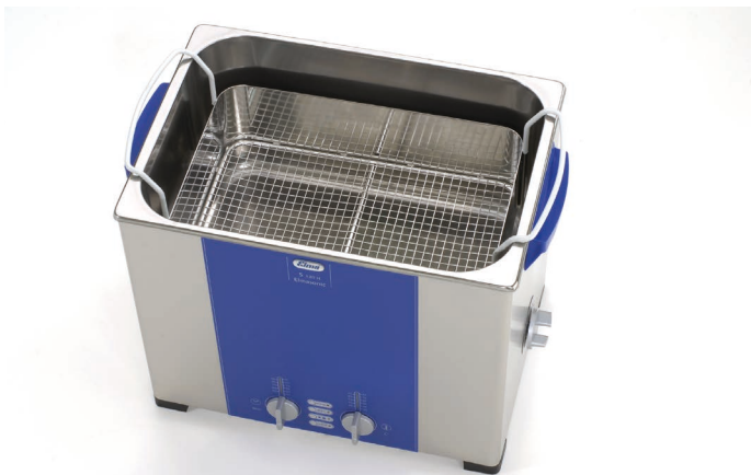
Cleaning (and, if necessary, disinfecting) individual instruments in the stainless steel basket