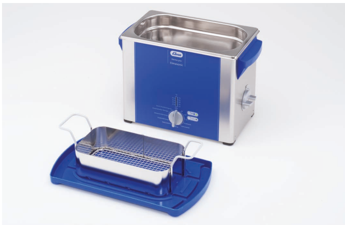
Denta Pro H with basket on cover