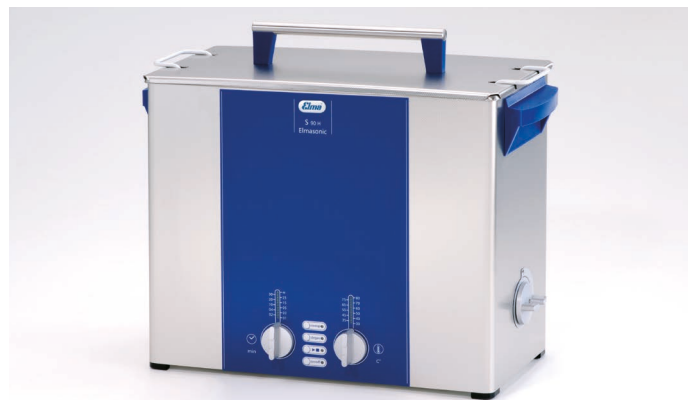
Elmasonic S 90H with cover

Elmasonic S units are thus reliable and cost-saving in daily use. The Elmasonic S 90 H is used for the optimal cleaning of norm tray cassettes with half DIN-norm size. Alternatively, a beaker glass and an instrument basket can also be simultaneously cleaned in the S 90 H.