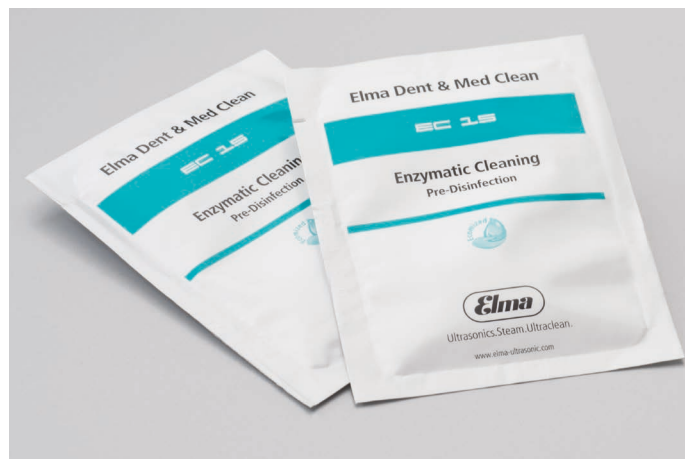
Elma Dent & Med Clean EC 15 Enzymatic Cleaning and Pre-Disinfection

The blue colouring of the granulate makes it easy to check on complete flushing of the solution from the instruments. Moreover, the solution has a fresh and hygienic appearance.