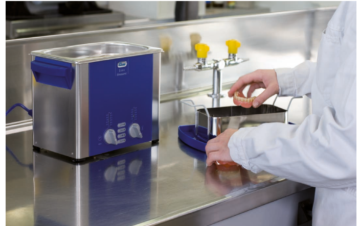
Elmasonic S ultrasonic device in the dental lab

Ultrasonic cleaning mainly concerns precision and final cleaning before the above are sent to the surgery. The delivered impression trays can be cleaned with the EC 25 Elma alginate remover. In so doing, the sonic together with the cleaning product infiltrate the bonding points. Alginates and hydrocolloids can then be removed from the tray.