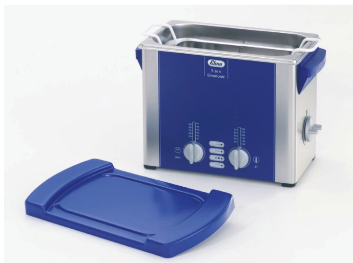
Elmasonic S 60H with cover and basket

Reliable ultrasonic technology for the effective cleaning of instruments