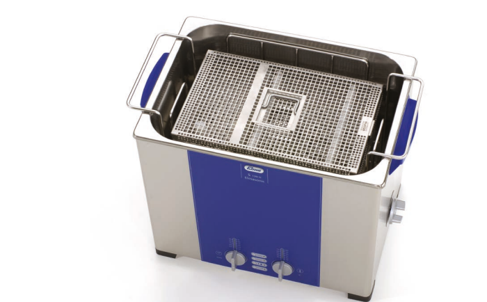
Cleaning (and if necessary disinfecting) instruments in dental trays in the tray holder