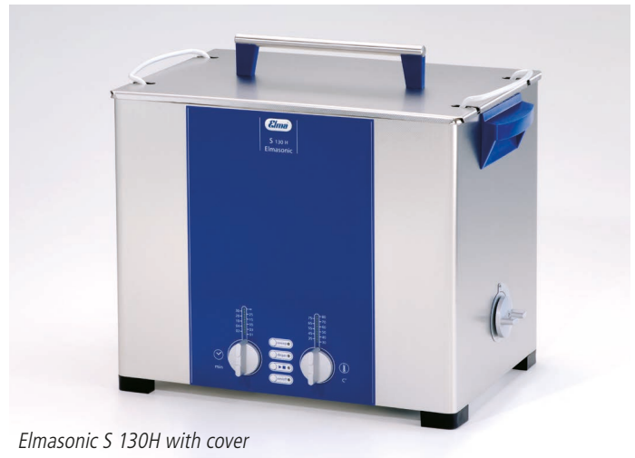
Elmasonic S 130H with cover

The Elmasonic S 130H is an ultrasonic cleaning device that caters for every requirement.