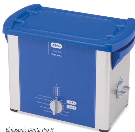
Elmasonic Denta Pro H

At the same time, the programmes ensure that the optimum cleaning process has been used. This also ensures constantly good cleaning results.