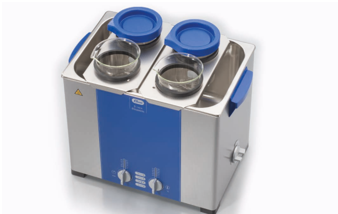
Cleaning (and if necessary disinfecting) in up to 4 beaker glasses simultaneously