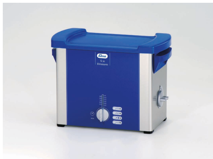
Elmasonic S 30 with cover

Elmasonic S units are available in 13 different sizes and have all technical features that are indispensable for dental applications.