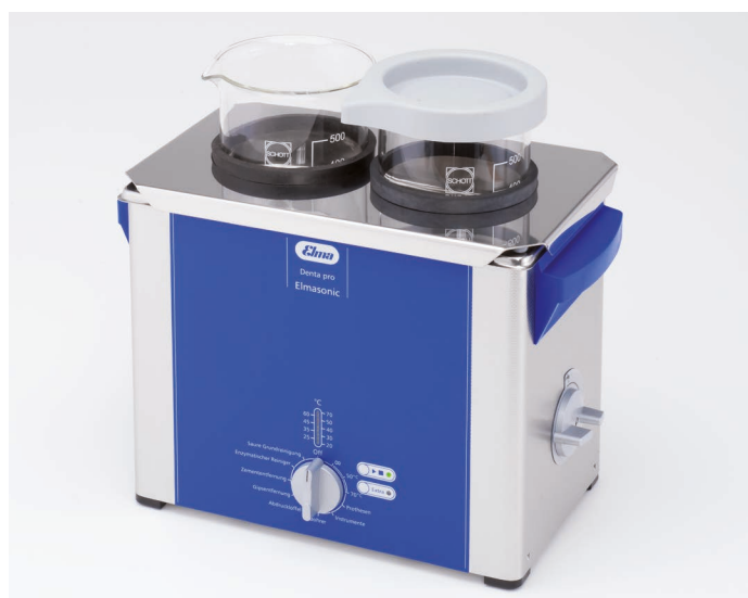
Elmasonic Denta pro H with glass beakers and stainless steel cover with holes